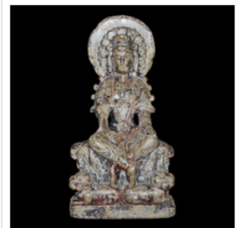
Northern Wei ) stone Bodhisattva. Mottled stone with some remaining pigment. 11" tall. 9.5 pounds. Lot 148. Gianguan Auctions, June 10.