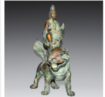
Bronze Bodhisattva Manjushri riding on the back of a Buddhist lion. 10" tall. Weight, 4 pounds. Lot 153. Gianguan Auctions, June 10, 2017.

The auction will be conducted live at the Gianguan Auction gallery, 39 W. 56th Street and on both liveauctioneers.com and invaluable.com .