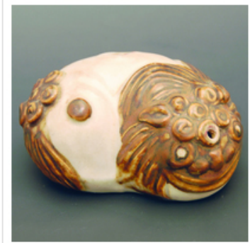
Abstract lion-form Korean water dropper. 3" X 3". Gianguan Auctions. Lot 283