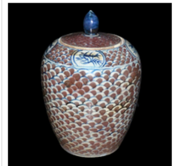
Korean ceramic red and blue jar decorated overall with waves. Gianguan Auctions. Lot 279