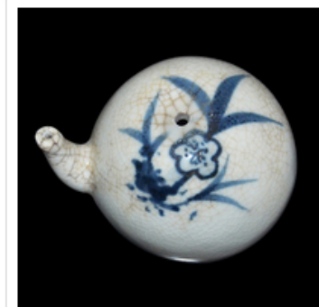
Josean Dynasty water dropper with floral flourishes. Gianguan Auctions. Lot 281