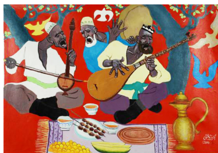
'Music.' Image courtesy of Gianguan Auctions.