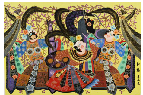
'Pray for Blessings.'