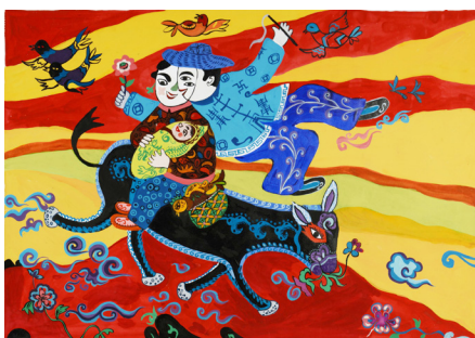
'Returning to Maternal Home.'