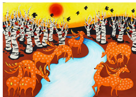
'Deer Drinking Among Oxen.'